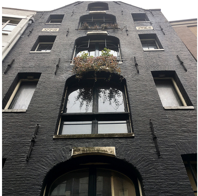
Building in Amsterdam built in 1720.